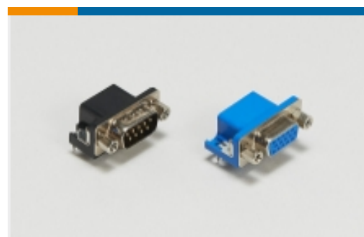
PCB D-Sub Connectors(191)